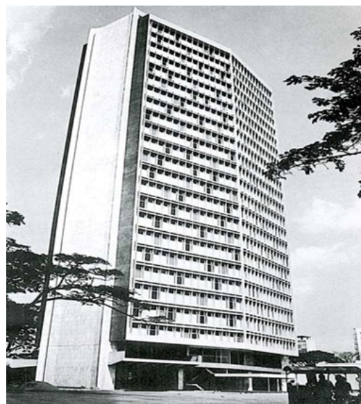
Figure 1. First Skyscraper in Tropical Africa

Africa see figure 1. below), when he noticed that government officials were stealing money through exorbitant hotel claims, he built big hotels, he then establish Odu'a Investment Company Ltd. (Odua group of companies) which take over other establishments like building of secondary schools and primary schools which was free for the locals, this is the reason why western Nigeria is the foremost in education till date, he made us realize the value of education. Establishment of these corporations boosted the socioeconomic fortune of the Western Region significantly. Chief Obafemi Awolowo was the backbone of our success story in the western region. Power was not an end in itself to him; he used his governance position as a responsibility to empower his community and his people. Awolowo's transformational leadership demonstrably transformed the Southwest into an infrastructural paradise that resonated even till now. It is just unfortunate that Awolowo's followers failed woefully to carry on with his legacy and vision for his people.